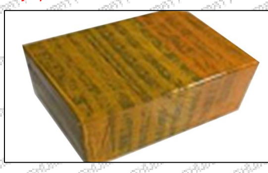
Pic No. 2 International express packaging: Wrapped with yellow tape after wrapping black protective film