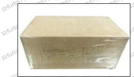
Pic No. 1 Domestic express packaging: Wrapped with Transparent tape